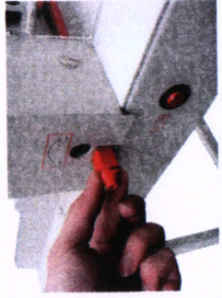
Easy cutting stick change design